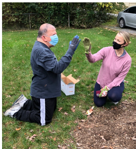
Junior League of Washington volunteers work with LRSS residents to plant 100 yellow tulip bulbs donated by Colonial Life.