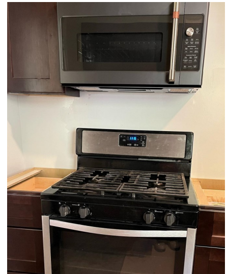
The kitchen renovation in progress...